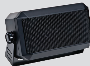
RSN4001 13W External Speaker