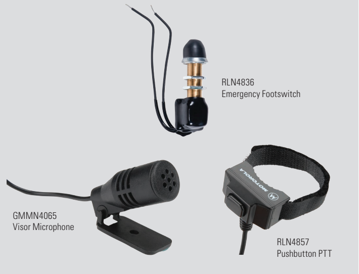
GMMN4065 Visor Microphone